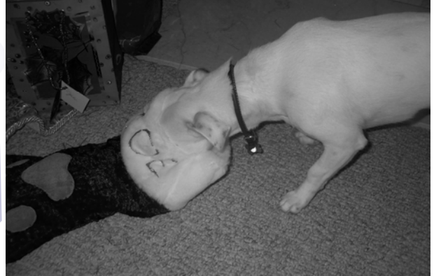
We Hope You Find Something Good In Your Stocking This Year. Happy Holidays From All Of Us At Desktop Valet.